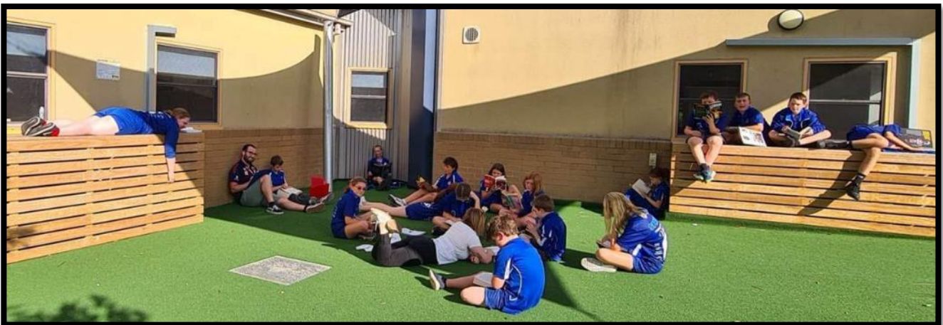
Photo of Grade 5/6 enjoying our Shade Sail area and the beautiful weather on Monday.