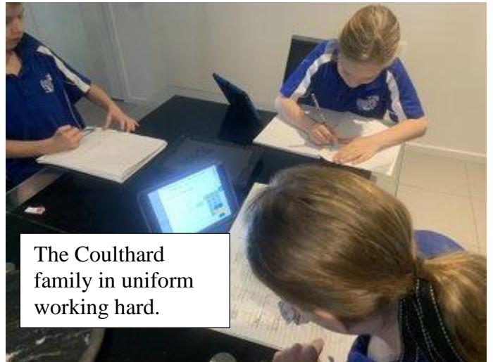
The Coulthard family in uniform working hard.